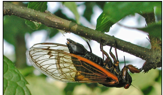
Figure 1. Egg-laying by periodical cicadas can cause significant damage to cultivated and forest trees. Flagging of damaged limbs is a common summer sight where these cicadas have been.

While a cicada emergence is truly an amazing experience for many, it can be very damaging to some crops like fruit trees, particularly young trees. The damage is done by the female during egg laying. She uses her egg-layer (ovipositor) to tear 1/3-inch slits into pencil thick limbs. She may make a dozen or more of these in a row, then in each of the slits she can lay a dozen or more eggs. These limbs are weakened and often crack and droop or break off entirely from the tree. This damage can disfigure young trees. After about 5 to 6 weeks, the eggs hatch and the nymphs drop to the ground where they tunnel through the soil in search of roots to feed on for the next 16 and a half years.